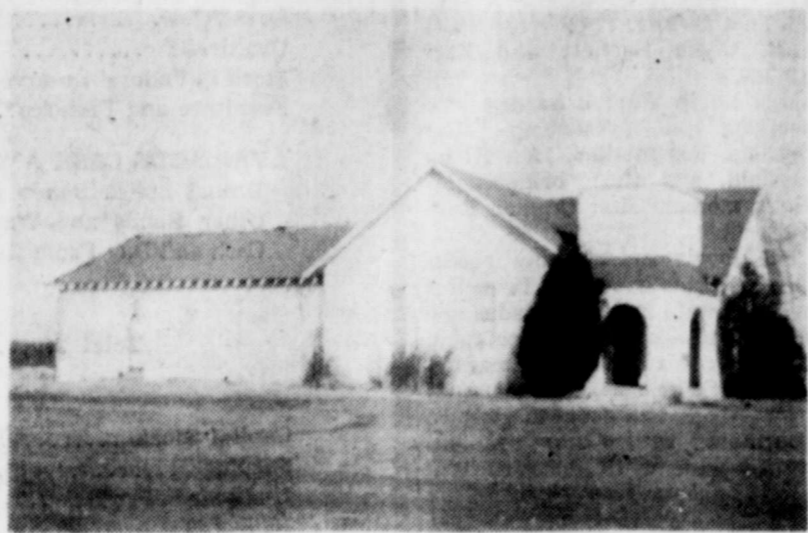
As the Tye Methodist Church Looks Today

There was no town here then. The railroad was not even here. Abilene was small and Buffalo