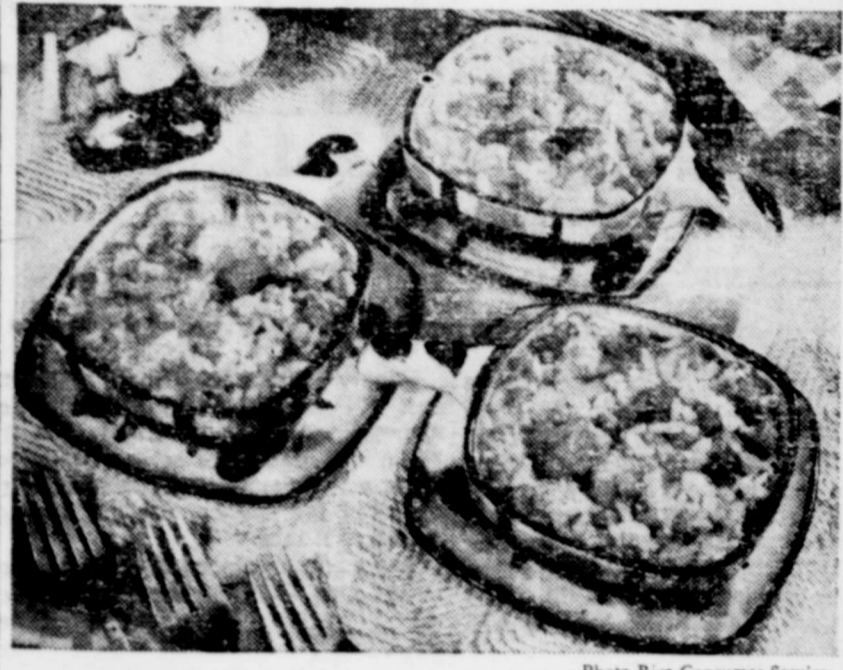
Chinese One Dish Meal — a Perfectly Wonderful Combination of Tender Rice and Beef

REALLY TOPS!! Those who eat this simply terrific rice and beef dish will praise you again and again. You'll see — because every food and seasoning in this main dish seems to be there for the purpose of adding that much more super flavor. Perhaps it is the bit of soy sauce which adds just the right touch. But whatever it is, keep a box of inexpensive rice on the shelf, add the other ingredients you don't happen to have on hand to your market order, and get set to make a terrific impression on all those lucky eaters of this simply super Rice and Beef Main Dish. INGREDIENTS: 1 pound of beef (or veal) cut in cubes, about 1/2 inch 2 cups onion, chopped 1 cup celery, chopped 2 tablespoons butter or margarine 1/2 cup uncooked rice 1 cup chicken consommé or use 1 chicken bouillon cube dissolved in 1 cup of water 1 can (1 1/2 cups) condensed cream of mushroom soup 1/4 cup soy sauce 1 1/2 cup green peas (may be uncooked) 1 teaspoon salt 1/4 teaspoon pepper 1 cup water METHOD: Cook the meat, onions and celery in the fat until the meat is browned. Add the uncooked rice, chicken soup, mushroom soup, soy sauce, green peas, salt, pepper and water. Bring to a boil. Cover. Turn the heat as low as possible and leave over this low heat for 45 minutes or until the rice is tender and the meat is done. Stir occasionally. This recipe makes 8 servings.