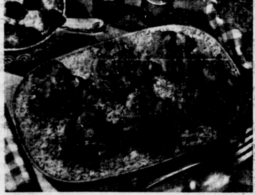
Rice and Short Ribs With Vegetables Make Mighty Succulent Fare

REALLY TOPS!! Those who eat this simply terrific rice and beef dish will praise you again and again. You'll see — because every food and seasoning in this main dish seems to be there for the purpose of adding that much more super flavor. Perhaps it is the bit of soy sauce which adds just the right touch. But whatever it is, keep a box of inexpensive rice on the shelf, add the other ingredients you don't happen to have on hand to your market order, and get set to make a terrific impression on all those lucky eaters of this simply super Rice and Beef Main Dish. INGREDIENTS: 1 pound of beef (or veal) cut in cubes, about 1/2 inch 2 cups onion, chopped 1 cup celery, chopped 2 tablespoons butter or margarine 1/2 cup uncooked rice 1 cup chicken consommé or use 1 chicken bouillon cube dissolved in 1 cup of water 1 can (1 1/2 cups) condensed cream of mushroom soup 1/4 cup soy sauce 1 1/2 cup green peas (may be uncooked) 1 teaspoon salt 1/4 teaspoon pepper 1 cup water METHOD: Cook the meat, onions and celery in the fat until the meat is browned. Add the uncooked rice, chicken soup, mushroom soup, soy sauce, green peas, salt, pepper and water. Bring to a boil. Cover. Turn the heat as low as possible and leave over this low heat for 45 minutes or until the rice is tender and the meat is done. Stir occasionally. This recipe makes 8 servings.