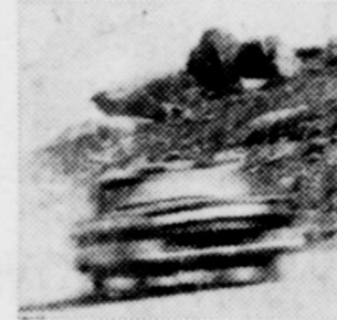
Last fall, Chevrolet broke the Pikes Peak record in a history-making pre-production test.

Chevy beats own Pikes Peak record . . . and tops all rivals including cars in every price range!