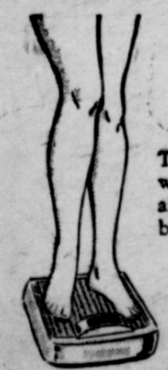
With the Kessamin reducing plan the only thing you can lose is weight!