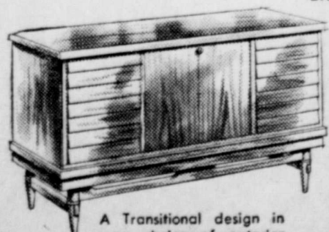
A Transitional design in your choice of exterior woods. Has self-rising tray. No. 6731 $69.95