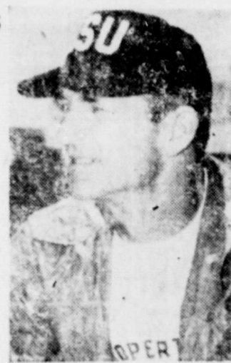
Coach Sammy Baugh