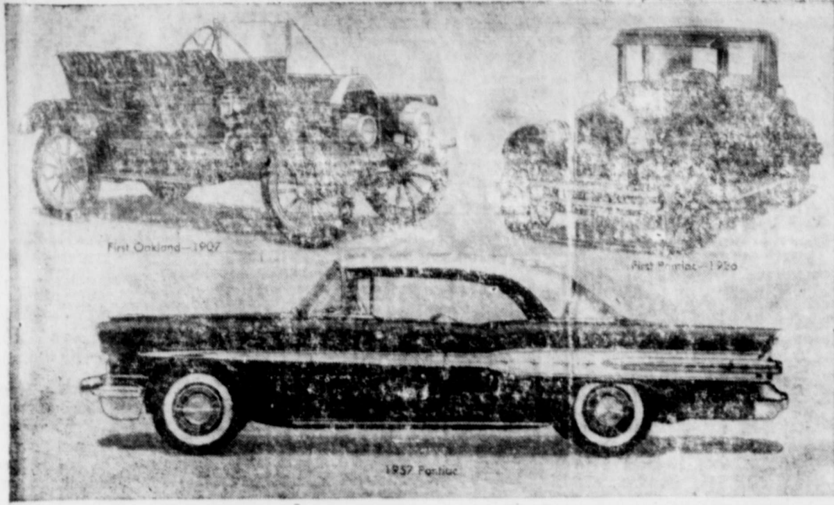
PONTIAC MOTOR DIVISION is observing its 50th anniversary of automobile production since the company was first organized on August 28, 1907, at Pontiac, Mich., as the Oakland Motor Car Company. During the half century seven million cars have been built and nearly six and one-half million of that number were Pontiacs, which were introduced in 1926. In 1931 the firm's name was changed to Pontiac Motor Division when the Oakland car was discontinued.