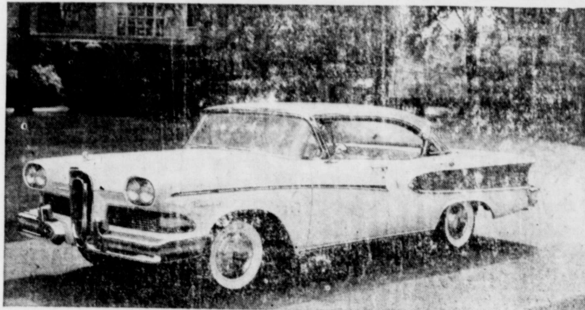
THIS IS THE EDELSEL, Ford Motor Company's newest entry in the medium price car field, available in 18 models in four series—Ranger, Pacer, Corsair and Citation. The entire line will go on display in all Edsel dealerships Sept. 1th. Shown is the Pacer four-door hardtop. From its vertical grille, dual headlights and wraparound turn indicators through the single chrome side spear and concave sculptured "teardrop" side scallop, the Edsel gives an impression of motion even when parked. In addition to its dramatic styling, the Edsel offers a wide range of exclusive engineering features including "Teletouch" push button automatic transmission controls located in the steering wheel hub.