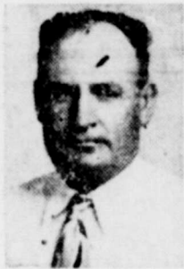
Up The Canyon By TOM RUSSOM

Well, our area is having some more spring weather. Farmers are slow to start planting anything due to the Easter cold days and the fact that the ground is still wet.