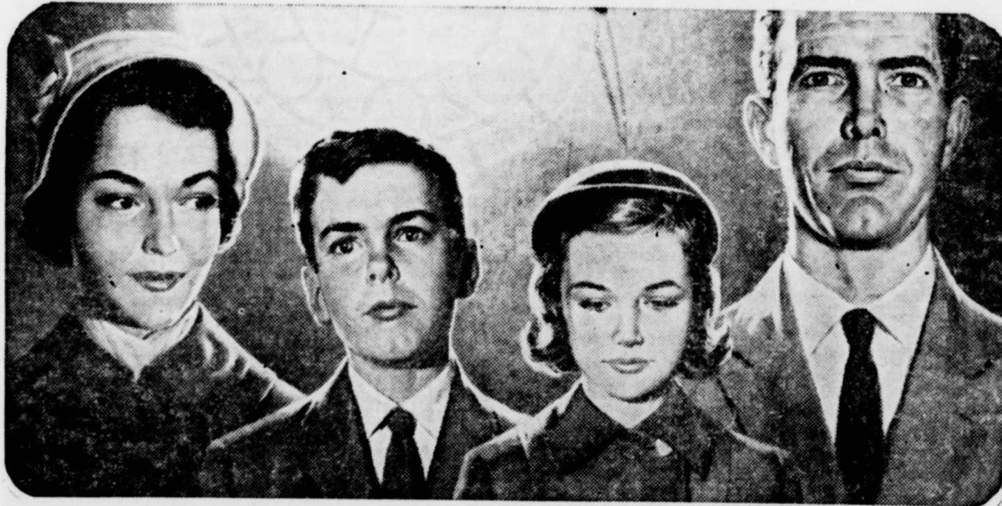
Help is only a prayer away