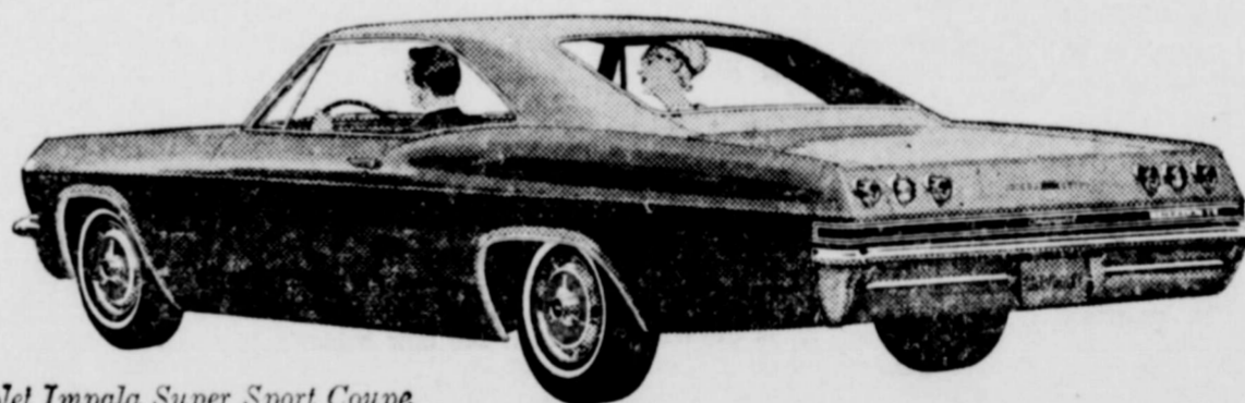
'65 Chevrolet Impala Super Sport Coupe

They're in our showroom now—ready for you to see and drive. So come on in and get the full story on the beautiful new Chevrolets for '65.