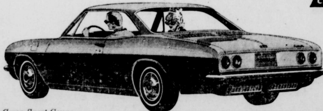
New Corvair Corsa Sport Coupe

It's a longer, lower, wider, roomier, quieter, handsomer, swankier kind of Chevrolet. Fact is, just about everything's new right down to the road. And even that'll seem newer. Because now Chevrolet's Jet-smooth ride is smoother than ever. And we're itching to show it off.