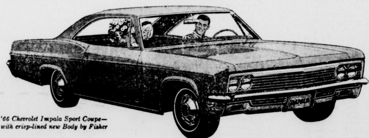
'66 Chevrolet Impala Sport Coupe—with crisp-lined new Body by Fisher