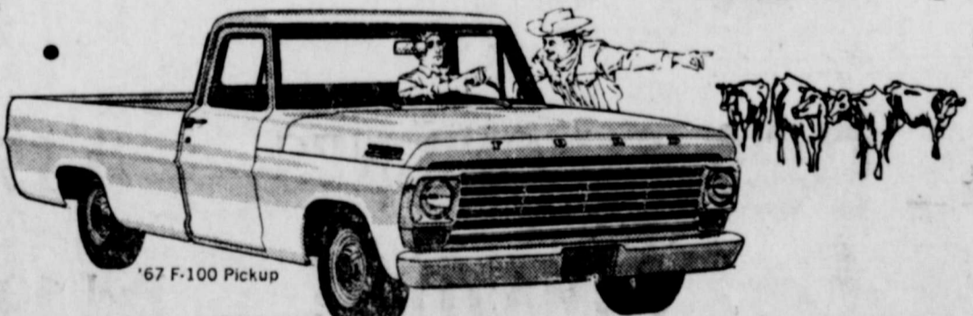
'67 F-100 Pickup