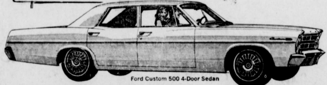
Ford Custom 500 4-Door Sedan