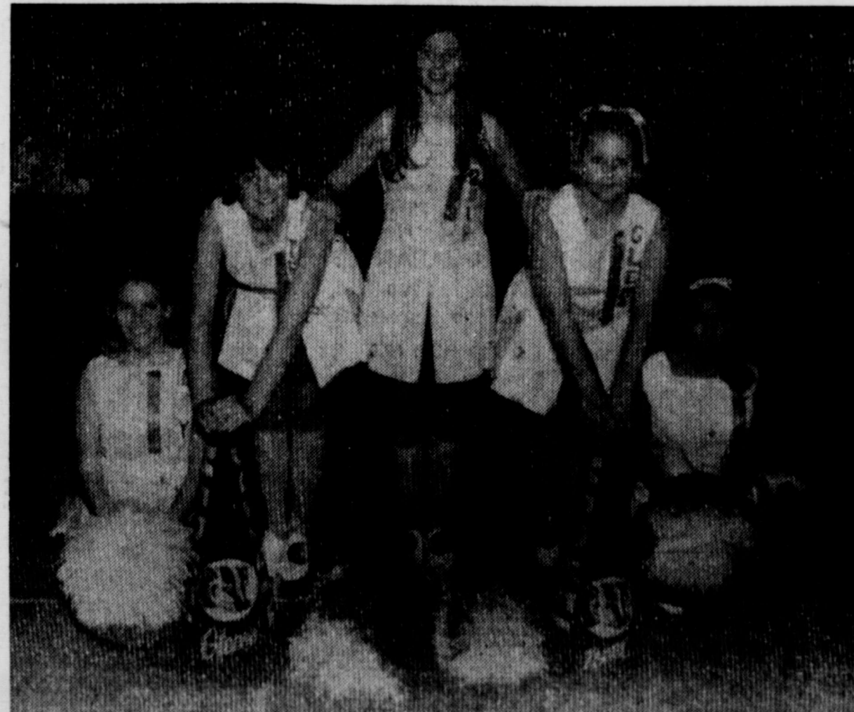
CHARGE — BADGERS — CHARGE — Leading the cheering section for the Badgers this coming Friday will be MHS Cheerleaders, and performing during halftime will be the MHS Twirlers. In picture at left

Local agencies benefiting from (Continued on Page Five)