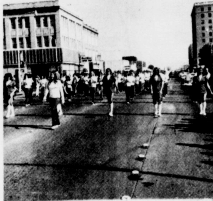
MERKEL HIGH BAND ... marches in WTF Parade