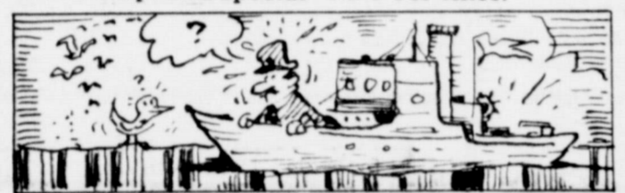
Although water freezes at 32 degrees F., salt water freezes at 28 degrees F.

pany's research headquarters in DeKalb, Ill. Two scholarships of $1,000 each are donated by Allied Mills, Inc. These go to current or former 4-H members who will be juniors majoring in animal science at a college or university this fall. Champion Valley Farms, Inc., Recipe Division, provides two Lassie 4-H Veterinary Medicine scholarships of $1,000 each to former 4-H members currently enrolled in a college of veterinary medicine. 4-H scholarships are a means of recognizing outstanding 4-H work and furthering the college education of present or former 4-H'ers. Recipients are chosen by the Cooperative Extension Service.