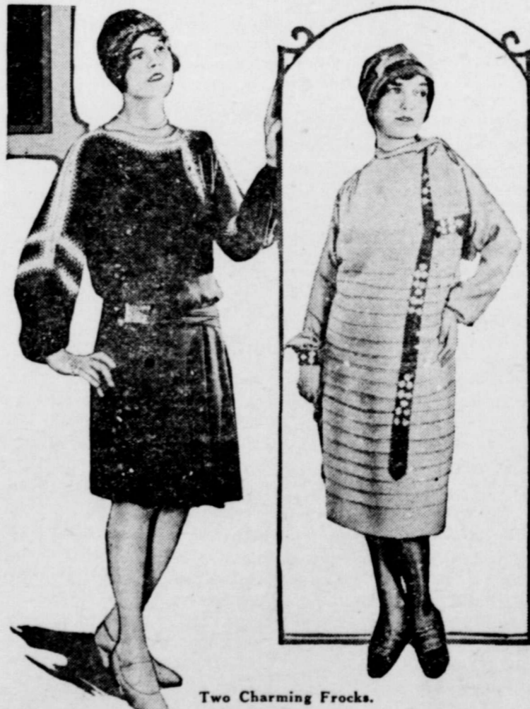
Two Charming Frocks.

At a recent Paris opening which introduced many interesting inter-season modes, the vogue for navy with white was foreshadowed in the model which is shown to the left in this illustration. This charming youthful model is of navy crepe with white bands inset with hand fagoting. And this reminds us, fagoting is used in abundance in