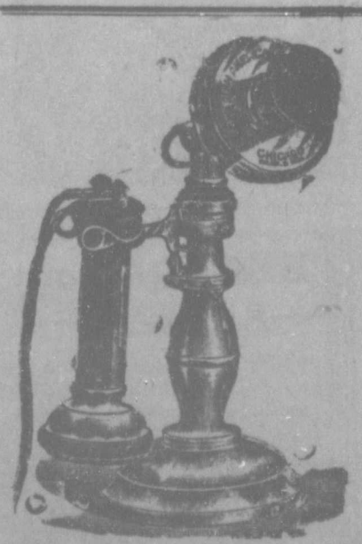
know a News Item