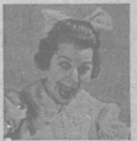
1 Who is this handsome youngster and who divorced her—to marry what swimmer, who was recently about 2,300 consecutive where did all this take place?