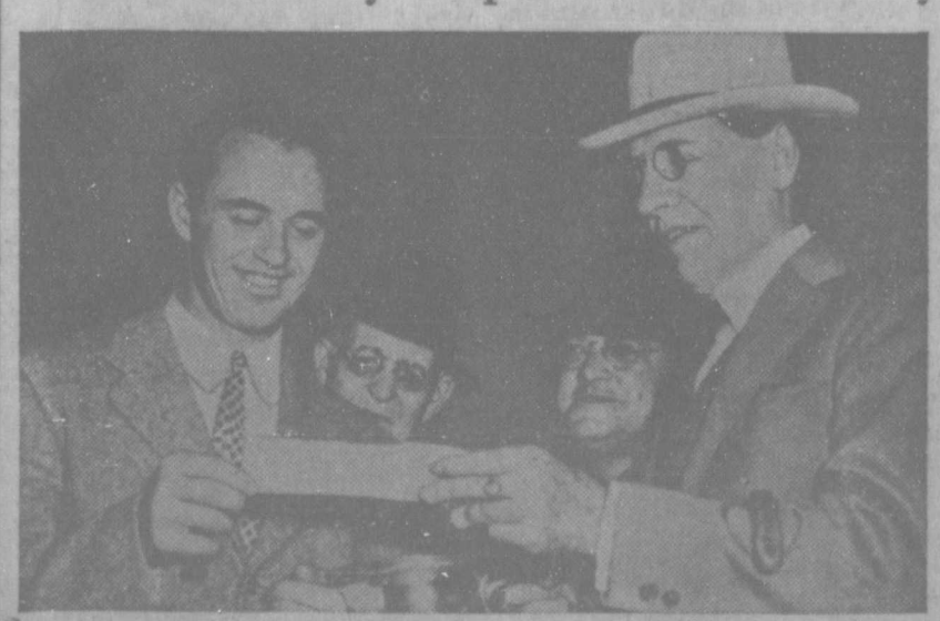
Slammin' Sammy Snead, winner of the sixteenth Miam' urnament, receives the first prize check of $2,500 from 'vell of Miami, Fla. Sammy carded a score of 271 to vell for the second time. His first victory came in 1937, so finish at the top of a power-