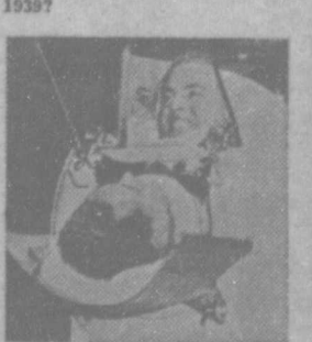
8 This young gentleman went traveling abroad last summer. What is his name and where did he go? What's wrong with him?