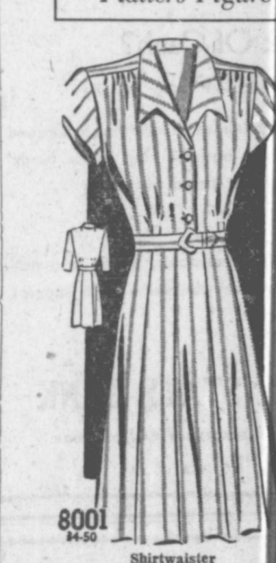
8001 34-50 Shirtwaister

A CAREFULLY tailored shirtwaist dress for women in the larger size range. Brief sleeves are comfortable and practical, the deeper notched collar adds a flattering note. Pattern provides short or three-quarter sleeves. You'll find it your year 'round favorite.