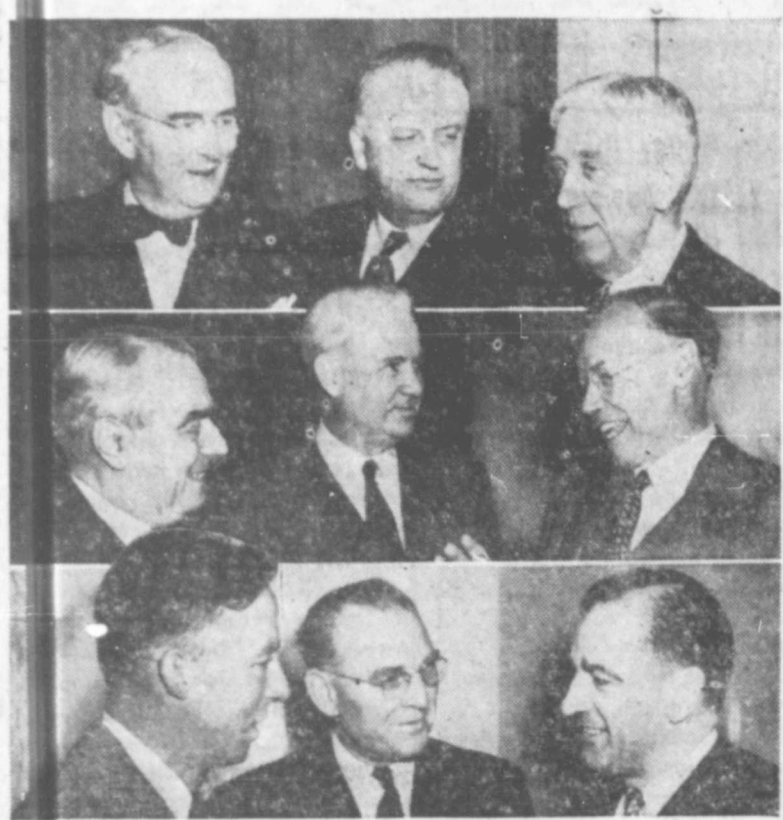
Opening of 80th congress saw Republican majority in limelight. At top, Senators Vandenberg (Mich.), Wherry (Neb.) and White (Me.). Middle, Senators Robertson (Wyo.), Bricker (Ohio) and Taft (Ohio). Bottom, Senators Cain (Wash.), Thye (Minn.) and McCarthy (Wis.).