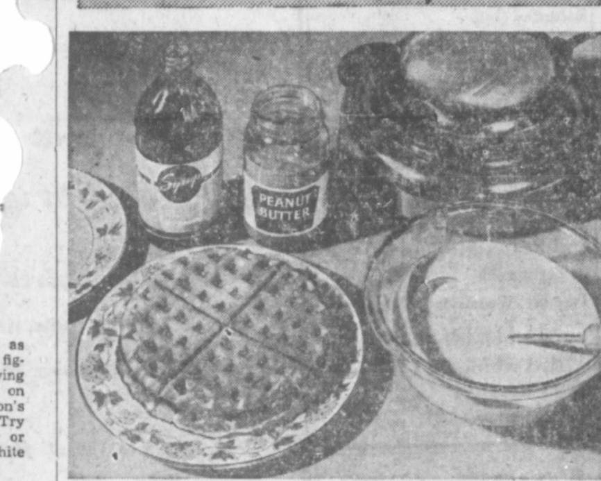
Serve Waffles for Any Occasion! (See recipes below)