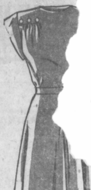
Pattern No. 8114

AS WINNING a date dress as you'll see is this youthful, figure-paring frock. Three glowing buttons top the soft gathers on bodice and hip, and the season's pet cap sleeves are featured. Try it in a brilliant wool or navy or black crepe accented with white buttons.