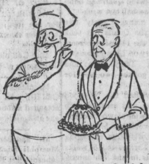
"I keep the recipe in a safety deposit box at the

NOTICE—Any erroneous reflection upon the character, standing or reputation of any person, firm or corporation which may appear in the columns of The Informer will gladly be corrected upon its being brought to the attention of the publisher.