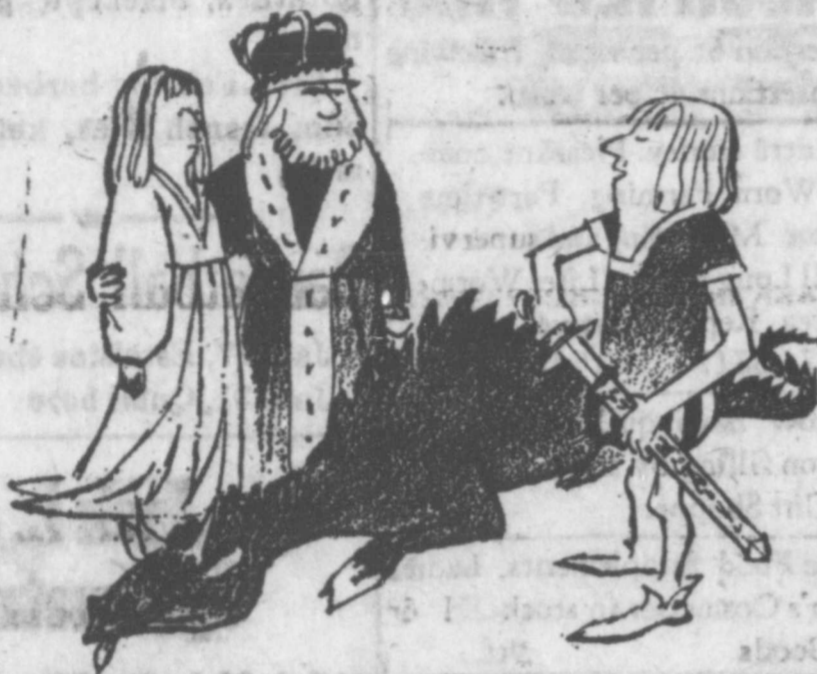
"Never mind your daughter's hand... just give me a check from..."

Published every Friday at Hedley, Texas. Entered as second class matter October 28, 1930, at the post office at Hedley, Texas under the Act of March 3, 1879. It is paid in part by the publisher. The publisher does not accept liability for damages in excess of the amount received for the subscription. Resolutions of respect, cards of thanks, advertisements for social functions, when admission charged, will be charged as advertising and charged for accordingly. Any erroneous reflection upon the character, standing or reputation of any person, firm or corporation which may appear in the columns of The Informer will gladly be corrected upon its being brought to the attention of the publisher.