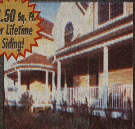
Patio Covers or Carports