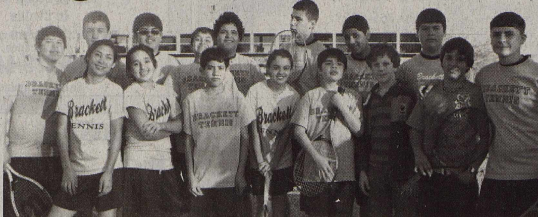
Brackett Junior High and High School students pose during tennis practice.

Track Team News The Brackett Varsity Girls Track Team participated in a meet in La Payor on Thursday, February 25. The girls placed second in a field of five teams. The results as follows: