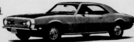
Camaro SS Sport Coupe