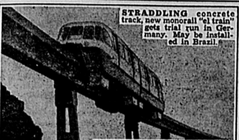
STRADDLING concrete track, new monorail "el train" gets trial run in Ger- many. May be install- ed in Brazil.