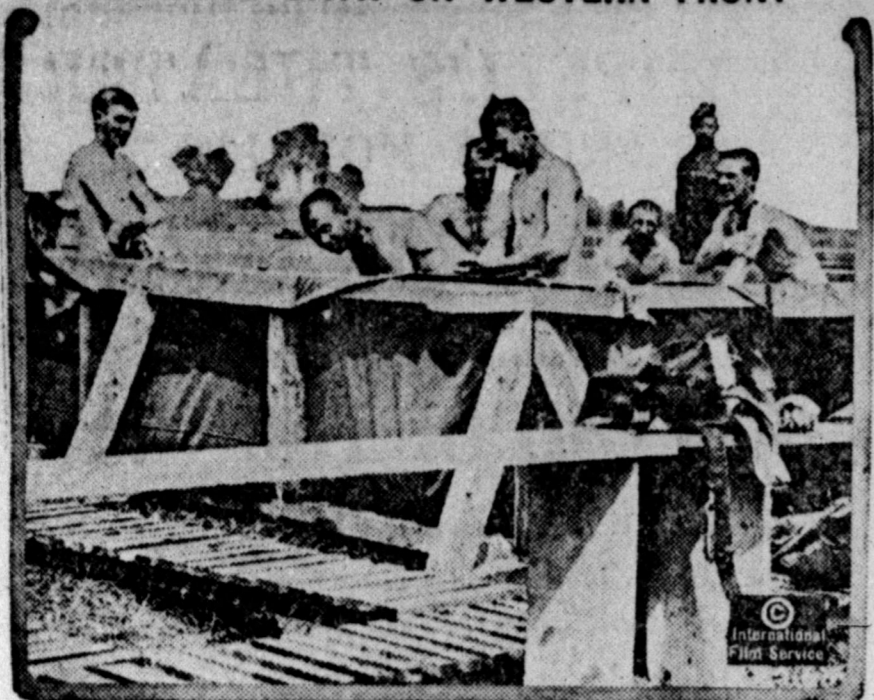
English troops on the western front having their morning bath in a tub made of timber and tarpaulin.