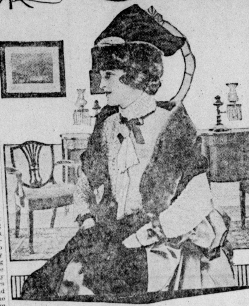
New Style in Matched Sets.

It is wonderful how big a part is played by cleverness of designing in the making of attractive clothes. Probably the women who get the most satisfaction out of their personal belongings are those who have comparatively small incomes to spend on themselves. They must exercise their wits, and they become observant; they learn to achieve style. This is more than some very rich women seem able to do.