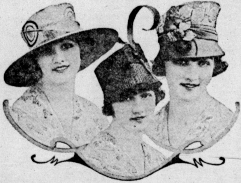
Three Classes of Hats.

Three hats belonging to three classes of millinery invite you to familiarize yourself with their distinct characteristics. Otherwise, when you go out to buy you are liable to make a mistake, unless you intend to invest in an assortment of millinery. Some enterprising and smart shops now place a small tag in each hat for the enlightenment of bewildered customers. This little tag bears a legend which places the hat in the right class. These little tags say with finality: "This hat is for sports wear," or "This hat is for traveling," or "This hat is for afternoon wear" and "This hat is for morning," etc. At this rate we may expect a hat for high noon; we already have them for the "wee sma' hours." In the group shown here the hat at the left is for sports wear. It is of oyster-white silk in a heavy crepe weave, with gayly colored disks to give it the right vivacity. The facing is of white millinery braid, and a single long and handsome quill appears to have lit on the brim. In millinery, as in other sports clothes, there is no limit to the courage of color. For street wear or traveling or morning wear, the small turban of black satin and straw braid demonstrates that a hat may scorn color of any kind and yet achieve the pinnacle of smartness. This shape is a miracle of becomingness and it is finished in the best possible way with a satin-lined curling quill in black, fastened by a strap of satin with satin-covered buttons at the ends. The dressy hat at the right is all in