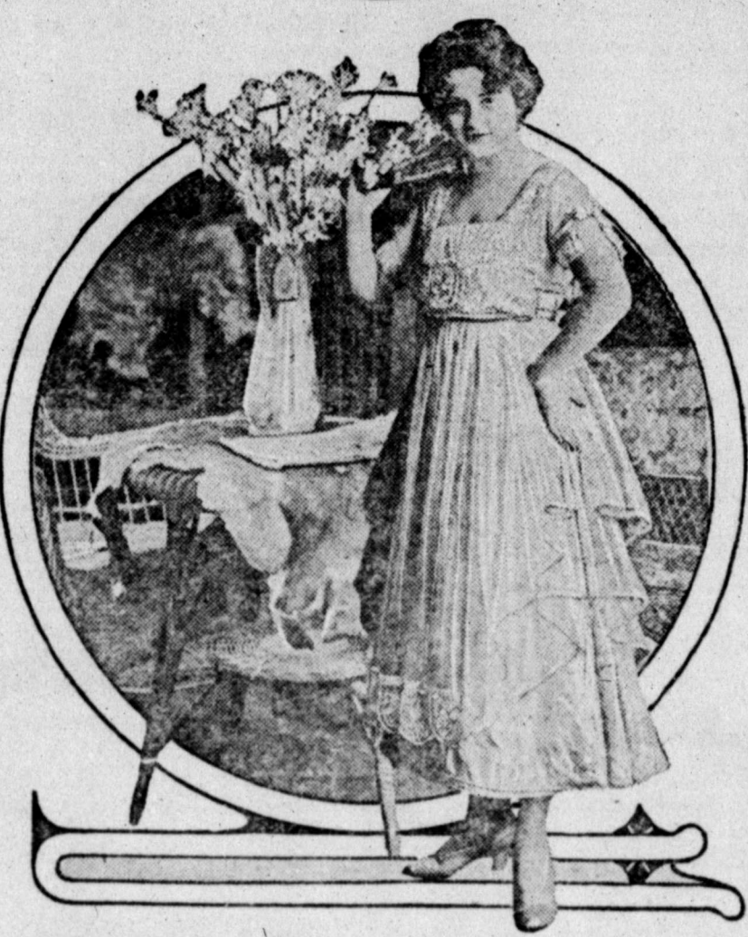
Pretty Frocks for Evening Wear.