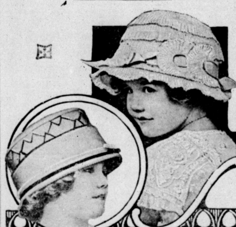
Easter Hats for Little Girls.

One of the new serge models is shown here and its fine lines and "class" flash themselves into the mind at a glance. The jacket is cut to the most popular length, is belted at the back and front and smartly finished with fancy buttons. The collar may be buttoned close to the neck, but is shown open, with adjustable over-collar in white. An attractive feature of this coat appears in the pockets which are made with extension laps. The sleeves flare at the cuffs, where one of the novel buttons is posed. It is as important here as the dot over an 'i'. The skirt is plain, gathered in full at the back and has a loose belt at the waist. It is a little longer than the skirts of the past two seasons, reaching about two inches below the tops of the shoes. Just as pictured this suit is of French serge in navy blue and after all it is said there is nothing better. But it has been developed in other colors of serge and is a success in any of them. The jacket is lined with peau-de-cygne which has become so well established that its name deserves an English translation.