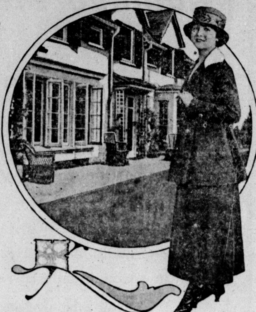
Classy Suit of French Serge.

The prophet who circulated the report that suits would not be in demand this spring is without honor in his own country or anywhere else. Either nobody paid him any attention or else each woman decided to act independently in this matter and to have a new spring suit whether anybody else wore one or not. A whole regiment of prophets might shout in pursuit of French, that suits are not to be worn, without influencing the loyalty of American women to the "tailor-made." Intuition convinces her that it suits her type and it is always the mainstay of her wardrobe.