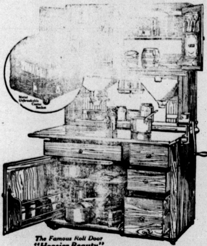
The Famous Roll Door "Hoosier Beauty"