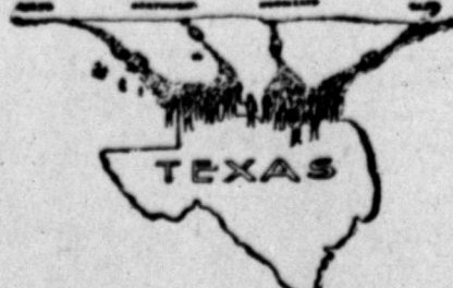
People Coming to Texas.

There are 109 counties that have less than 10 per cent of their land under cultivation. There are 43 counties that have a larger uncultivated area than the total area of the State of Rhode Island. The uncultivated area of Texas, says the Commercial Secretaries' Association, exceeds the total area of the thirteen original colonies, excepting Georgia and North Carolina. We need 3,000,000 farmers to develop our agricultural resources, and no country on the globe affords the opportunities to the homeseeker that Texas now offers. The land agent is an important factor in the development of agriculture. There are 190 people moving to Texas daily, and remain here permanently and of this number probably half of them go on the farm.