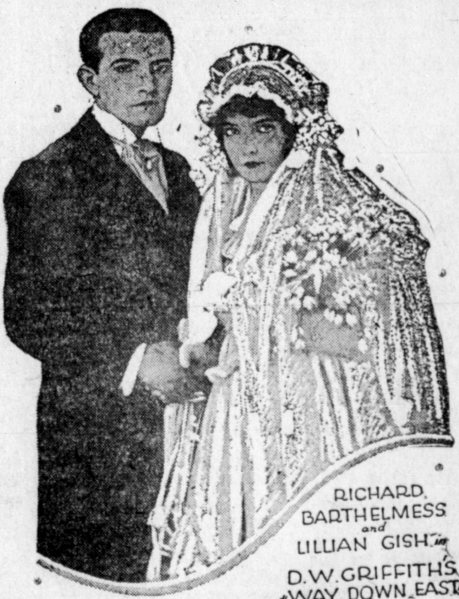
RICHARD BARTHELEMES and LILLIAN GISH in "WAY DOWN EAST" by D.W. GRIFFITHS

Monday and Tuesday, Dec. 11-12 THE PLAY HOUSE