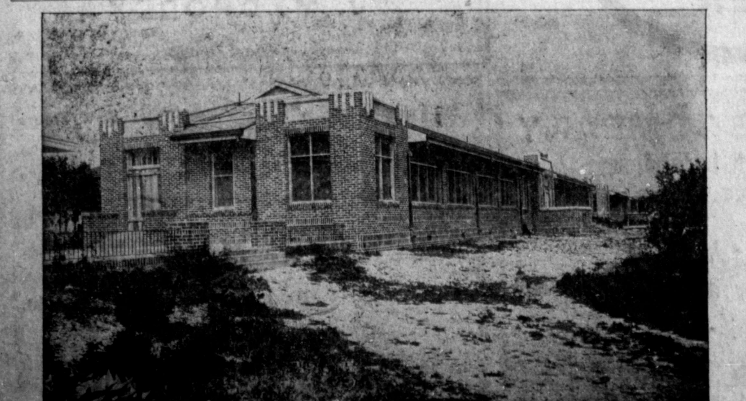
One of the Three New One-Story Ward Buildings, American Legion Memorial Sanatorium