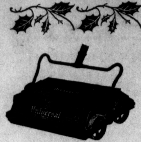
CARPET SWEEPERS $5.50