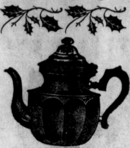
UNIVERSAL PERCOLATORS $4.25 and Up