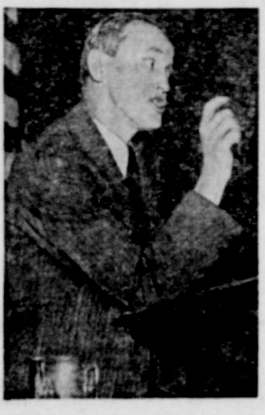
Harry L. Hopkins, WPA administrator, as he addressed the recent mayors' conference at Boston, Mass. His subject was "The National Program." Mayors from leading cities throughout the United States were in attendance. Their verdict was that the relief burden in big cities would be increased rather than lowered this winter.