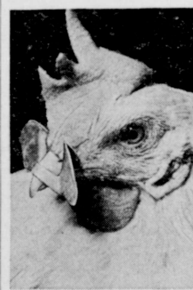
Improving the chicken's eyesight, they provide a blind spot, which prevents bullies in the flock from picking feathers from the more timid.

Hen spectacles are really for chickens and they make the fowls as wise as they look. This educated hen is wearing the new specs which are made of metal and instead of