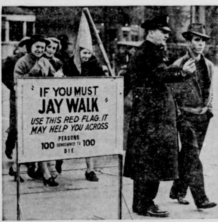
Jaywalkers on the public square in Cleveland were politely reminded by police that using a red flag placed there for their convenience "might" help them in darting across the streets when the traffic lights were against them. It was all part of a traffic safety campaign to reduce the number of motor fatalities that have been mounting rapidly.