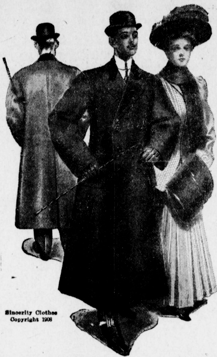
Sincerity Clothes Copyright 1908