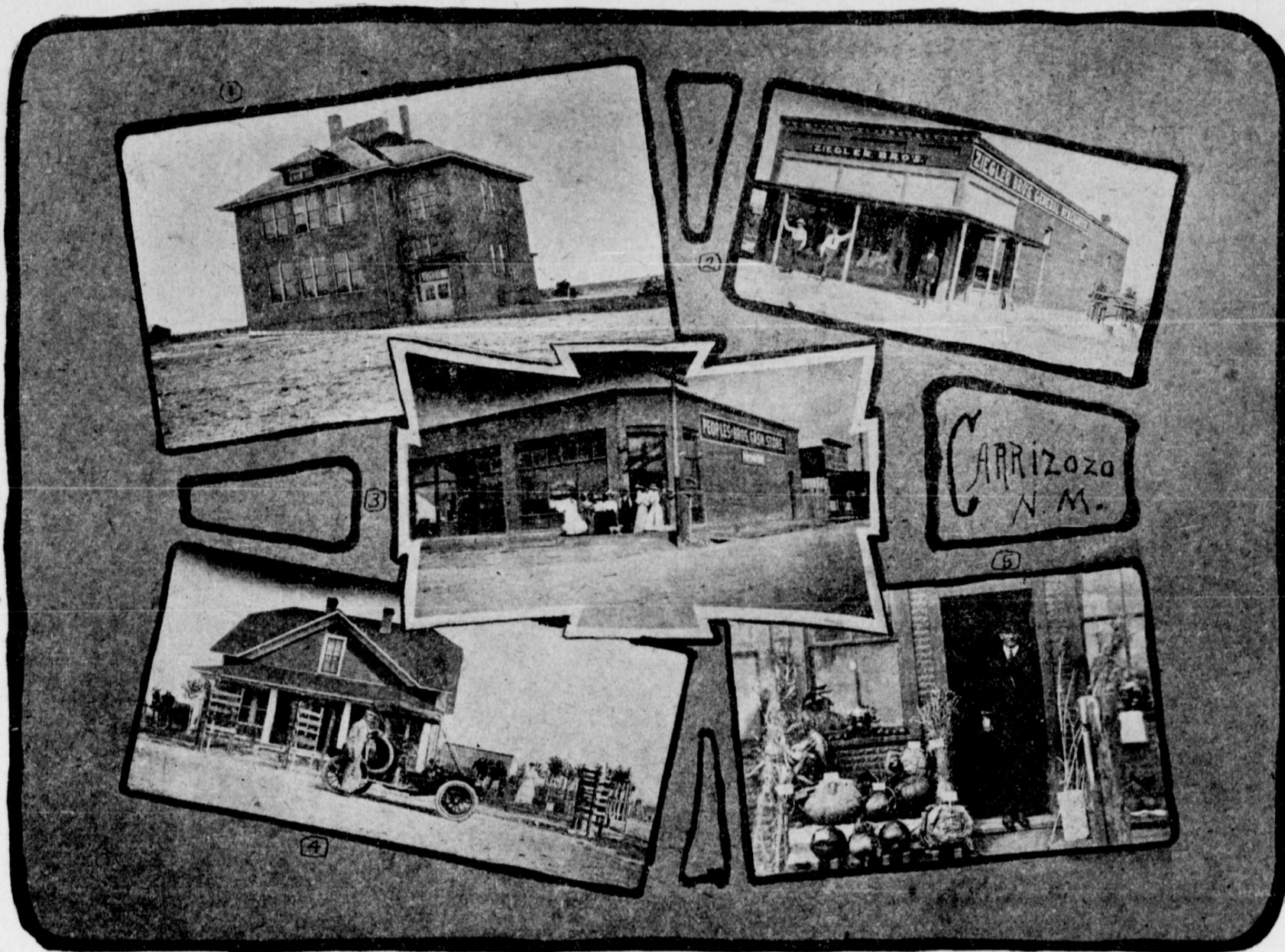
(1) Carrizozo Public School. (2) Ziegler Bros. Store. (3) People Bros. Store. (4) The Glenn Residence. (5) Dry Farming Products Grown in the Carrizozo Valley

PATENT LAWYERS, 303 Seventh St., Washington, D. C.