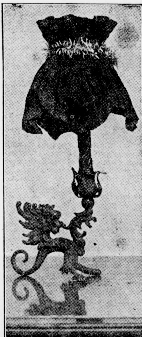
The Paper Candle Shade.

Decorate the Christmas tree with the silver tinsel and in the manner