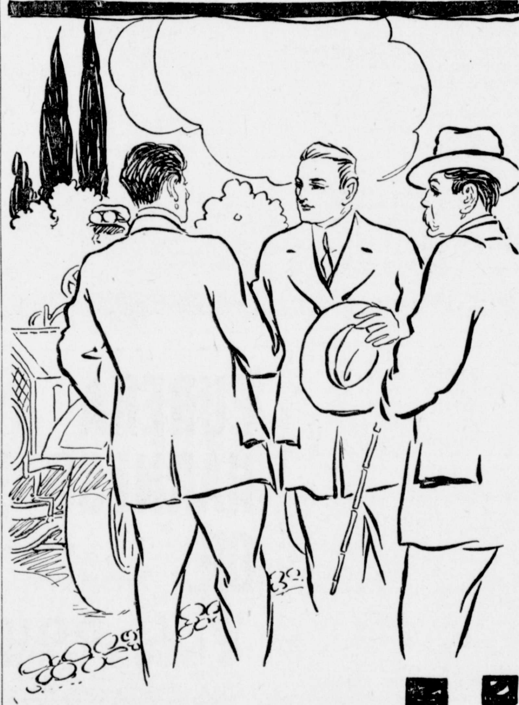
Covered the Distance in a Little Less Than an Hour.

She didn't answer, and I went down the corridor and descended the stairs in considerable of a temper, I admit.