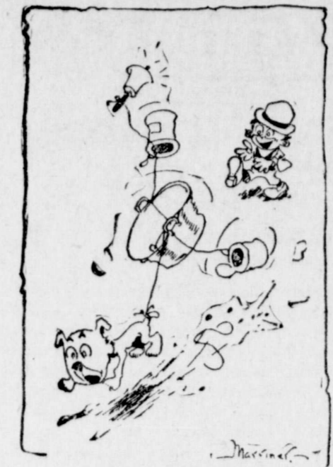
"Bound to a Cur."

A life-saving service for the rescue of miners in time of disaster has just been inaugurated by the United States Bureau of Mines. Six specially constructed cars, fully manned by a corps of miners trained in rescue work and equipped with the latest apparatus and first-aid appliances have been located in the midst of the great coal districts in different parts of the country. These cars will be ready at a moment's notice to proceed to the scene of a disaster, where the rescue corps, in co-operation with the state mining officials, will do everything possible to save entombed miners.