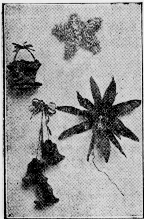
Bonbon Basket of Paper, Tinsel Stars, Poinsettia Flowers, Paper Bells.

Sometime before Christmas, say six weeks, buy a roll of dark red crape paper and one of olive green crape paper, also a sheet of yellow tissue paper. Buy some cheap bonnet wire from the milliner. Use a real poinsettia blossom for the pattern or buy one already made of paper, and proceed to make up two dozen poinsettia blossoms. First cut patterns, from a piece of wrapping paper, of the petals of the poinsettia. Open the rolls of crape paper and stretch them. A roll of ten feet will stretch to fifteen and be improved thereby, for some purposes. To stretch the paper let some one hold one end for you while you pull the other gradually, or tack