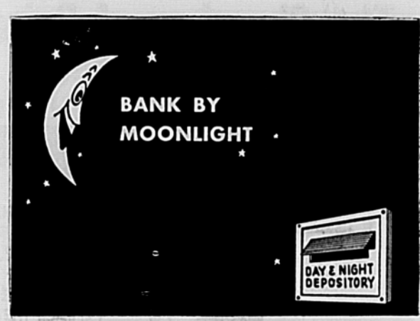
Any hour of the day or night, week ends and holidays, our Day and Night Depository is open to receive your hard-earned dollars. Ask about this convenient service.