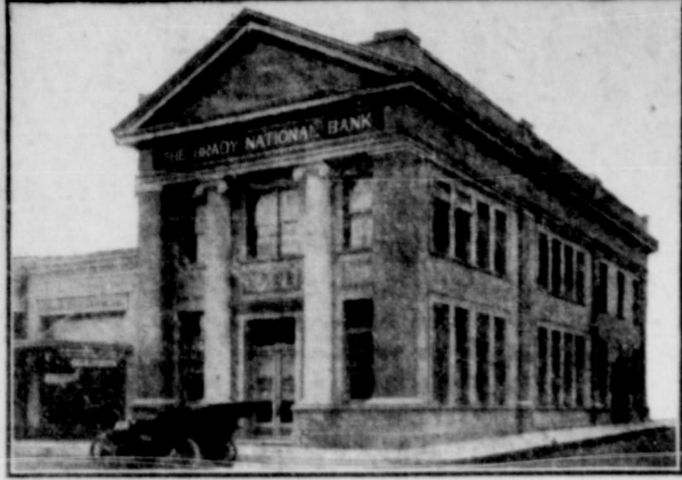
Make OUR Bank YOUR Bank