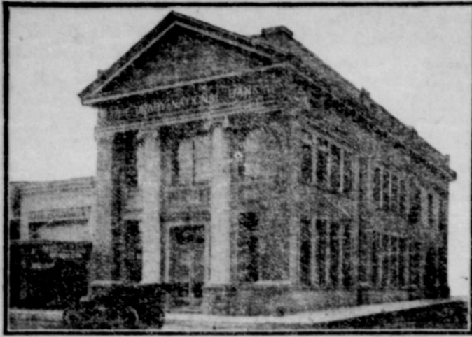
MakE OUR Bank YOUR Bank