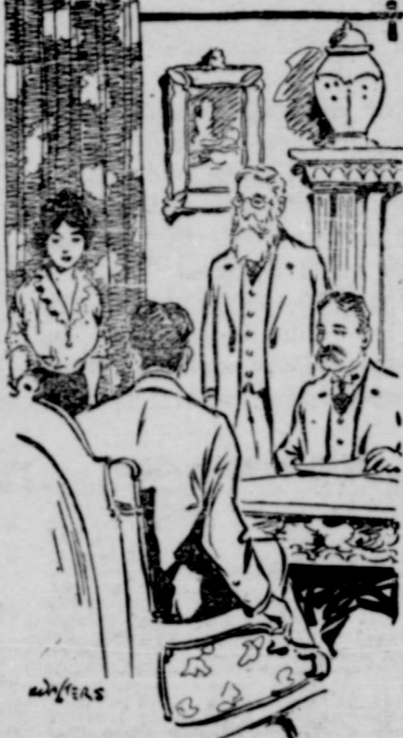
The Most Beautiful Girl That Johnson Had Ever Seen.

(Copyright, 1915, by W. G. Chapman.) "Your lordship, this gentleman is Mr. Johnson," announced the agent. Lord Clavering rose slowly out of his chair and bowed. Johnson noticed that it did not occur to him to extend his hand. The old man, with his white, flowing beard and flashing eyes, his bowed shoulders and sense of being one with the historic past of his race, presented a pitiful spectacle. "Sit down, sir," said Lord Clavering. "Mr. Jones," he added, to the agent, "will you please call Lady Elinor?" But it was not necessary for the agent to stir, for at that moment there came into the room the most beautiful girl that Johnson had ever seen. "This gentleman is Mr. Johnson," said Lord Clavering to his daughter, and Lady Elinor bowed. Again Johnson noticed that it did not occur to her to extend her hand. The agent cleared his throat. "Hum! This is a little—painful, your lord-