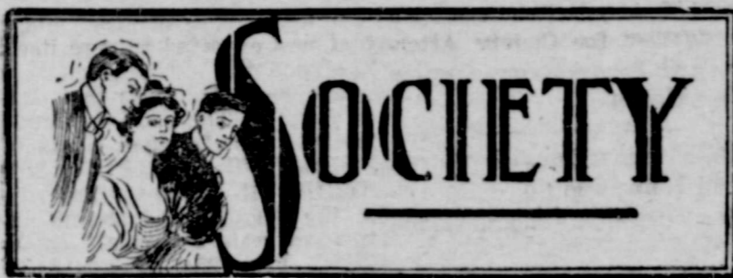
Ring 163 If You Have Items for These Columns.

THE PERUNA COMPANY Columbus, Ohio (Sold at all Drug Stores)