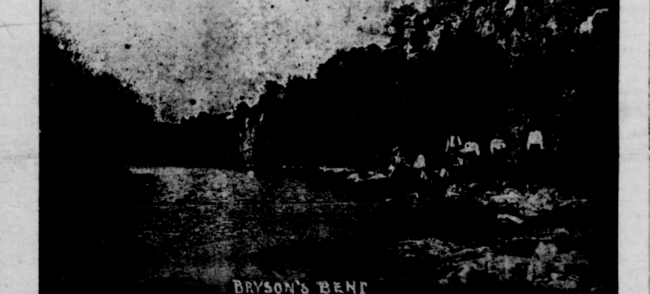
BRYSON'S BEND, A BEAUTY SPOT ON BRADY CREEK, WHERE MASONIC PICNIC WAS HELD

"That's all tight. He can put you to sleep."—Batimore American.