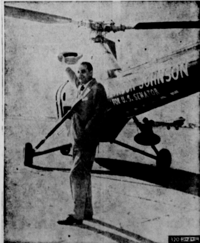
Pictured above is Lyndon Johnson, candidate for the U. S. Senate, and his helicopter. Congressman Johnson was in Bronte last week in the interests of his campaign to be Texas' Junior Senator. A crowd of approximately 200 people heard Johnson's speech and viewed with interest the helicopter in which he has made his whirlwind tour of the state.