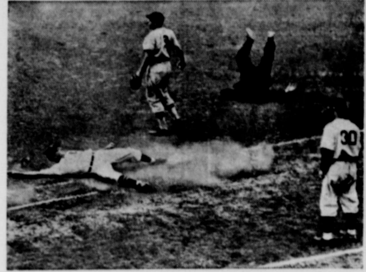
An umpire has his ups and downs, as shown in this novel Speed Graphic shot made at Briggs Stadium, Detroit. The runner was safe but the first baseman, in covering the bag, accidentally knocked over the umpire. Photographer Monroe Stroecker used a special camera focusing device that can be adjusted rapidly to follow the fast-moving play.