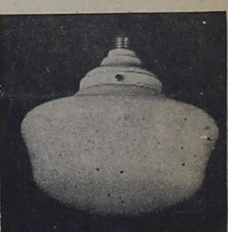
Renewalite ... $1.95

We'll be glad for you to try one-or as many- of these units in your home-FREE. Just ask any employee.