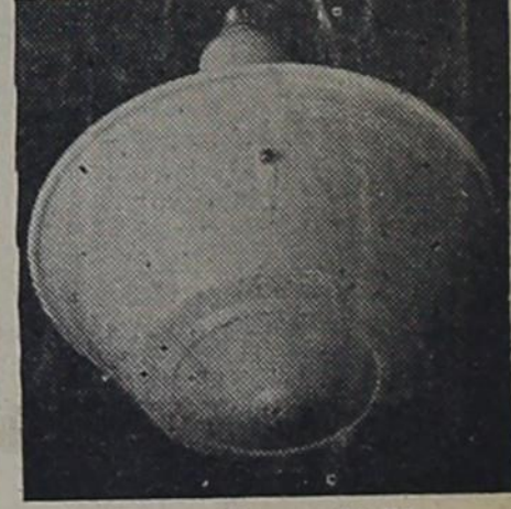
Hemcolite ... $1.75

... and these units are the best inexpensive fixtures that money can buy.