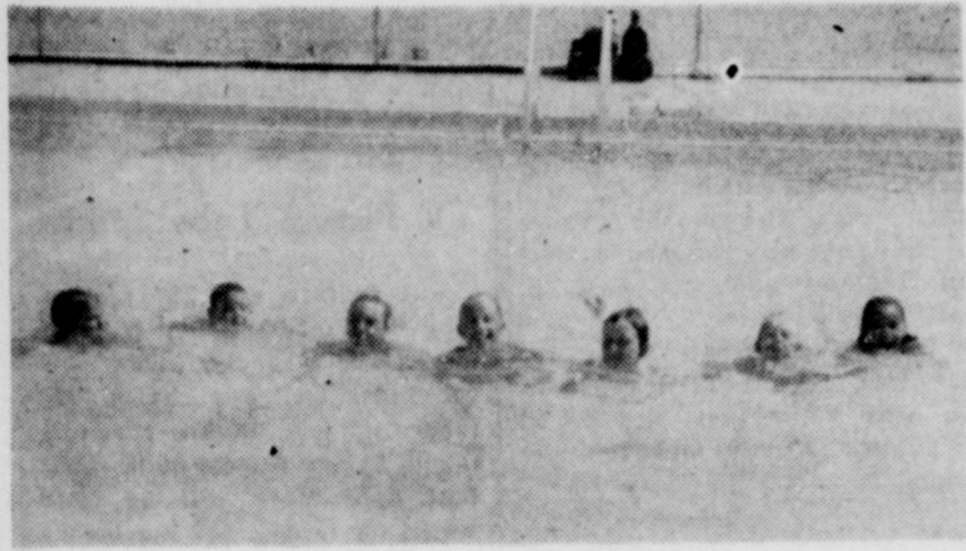
Completing the Intermediate swimming course recently at the local pool were the youngsters above. Left to right, they