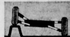
Chevy Independent Front Suspension. Wheels flex independently, minimize body wear and tear.