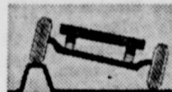
I-beam type front axle. A stiff-beam design that transmits road shock right through the truck.

Because they ride easier they last longer, too. They take better care of payloads and they make a long day's work a lot more pleasant for the driver. All that—primarily because of Independent Front Suspension (I.F.S.). If you think it's stretching a point to attribute that many advantages to a suspension system, you haven't driven a new Chevy with I.F.S. Take the wheel and feel its road-leveling ride, its almost total absence of shimmy and wheel fight, its ease of steering even in the big rigs. Spend hours behind the wheel and you're not nearly as tired. You're not and neither is the truck. That independent suspension soaks up the worst shock and vibration—the kind that can twist sheet metal and loosen joints and increase your maintenance costs. That's why Chevy trucks keep on working and saving for extra thousands of miles.