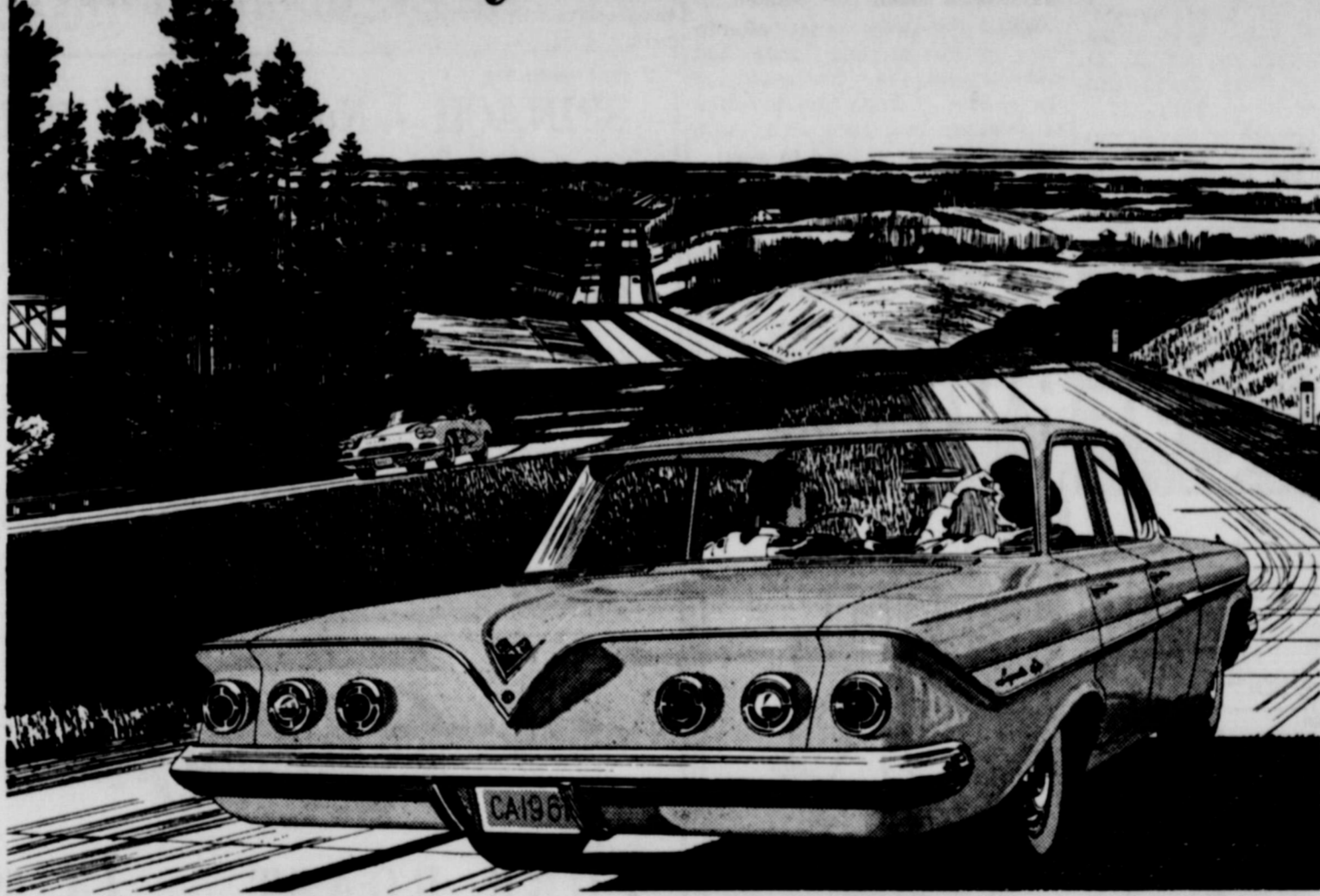
Impala 4-Door Sedan—Jet-smooth traveler that rivals the luxury cars in everything but price

The '61 Chevy loves to go because it goes so well. Purrs along pavements like a happy tabby. Takes rough roads in stride and all roads in style.