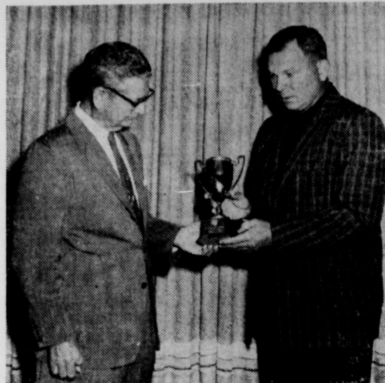
West Texas Utilities Company was the recipient of the Texas 4-H Club Achievement Award at the Texas 4-H Club Roundup held at College Station, Texas, June 6.