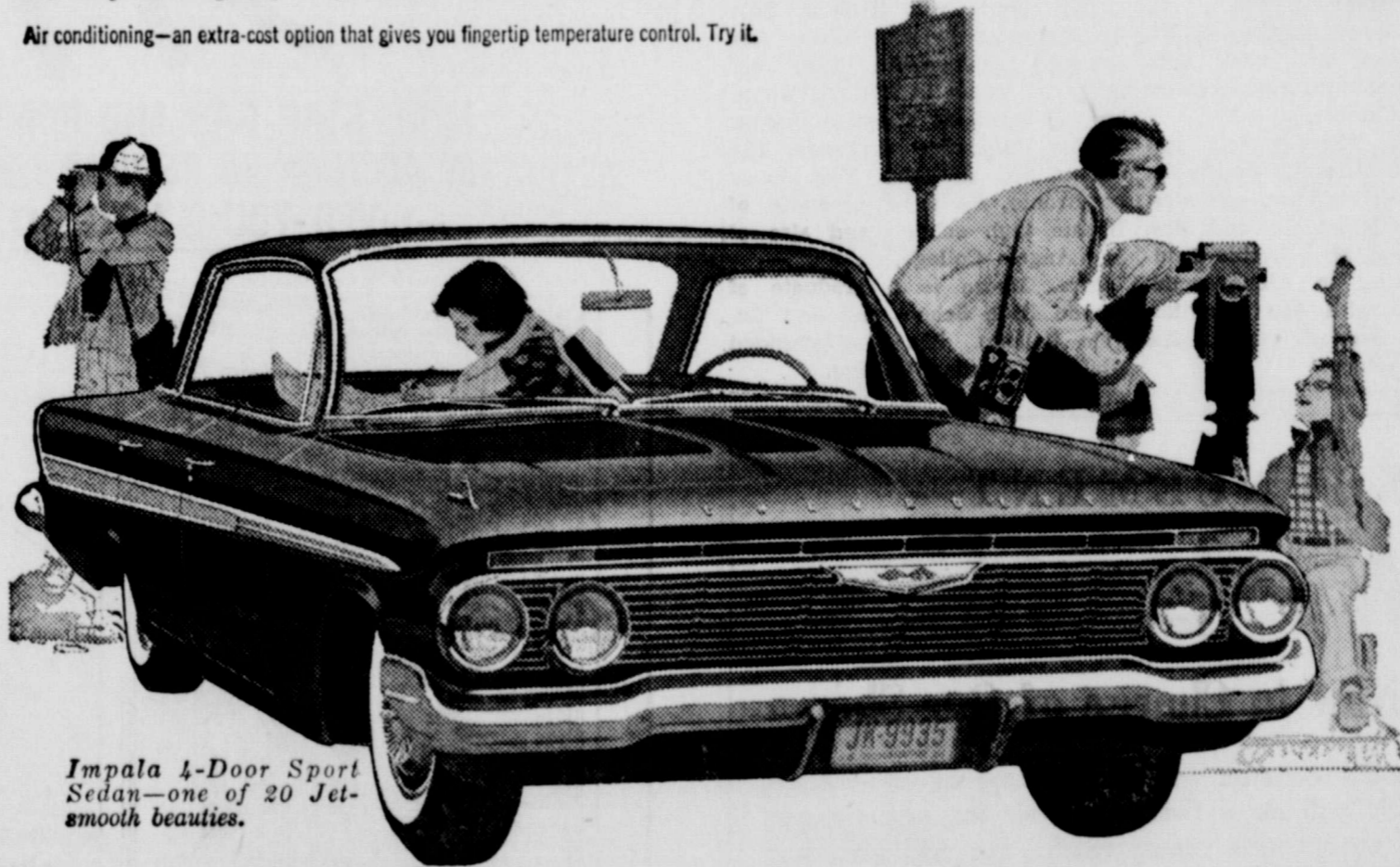
Impala 4-Door Sport Sedan—one of 20 Jet-smooth beauties.

Air conditioning—an extra-cost option that gives you fingertip temperature control. Try it.