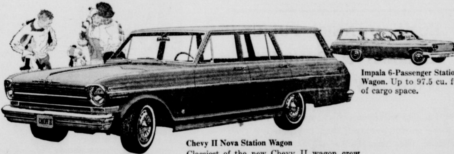
Impala 6-Passenger Station Wagon. Up to 97.5 cu. ft. of cargo space.

... in a beautiful variety of styles, sizes and prices