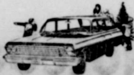
Biscayne 6-Passenger Station Wagon. Lowest priced Jet-smooth wagon.