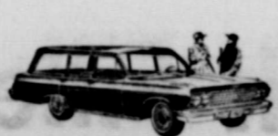
Impala 9-Passenger Station Wagon. Most elegant Chevrolet wagon.

For Your Best VALENTINE Priced 69c to $7.00 Large Selection of Valentines, too CENTRAL DRUG