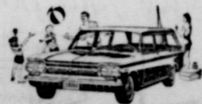
Corvair 700 Station Wagon. Extra load space in that trunk up front.