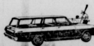
Chevy II 300 3-Seat Station Wagon. Lowest priced U.S. 3-seat station wagon.