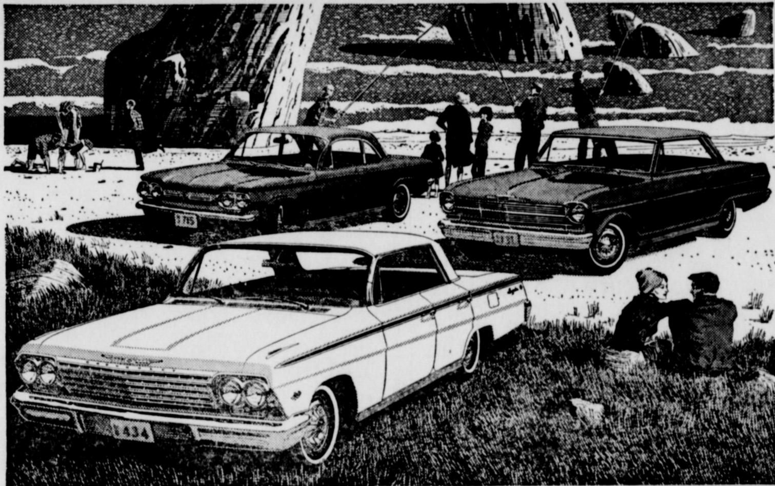
CHEVROLET IMPALA Room, refinement and riding comfort. Foreground, the Impala Sport Sedan.