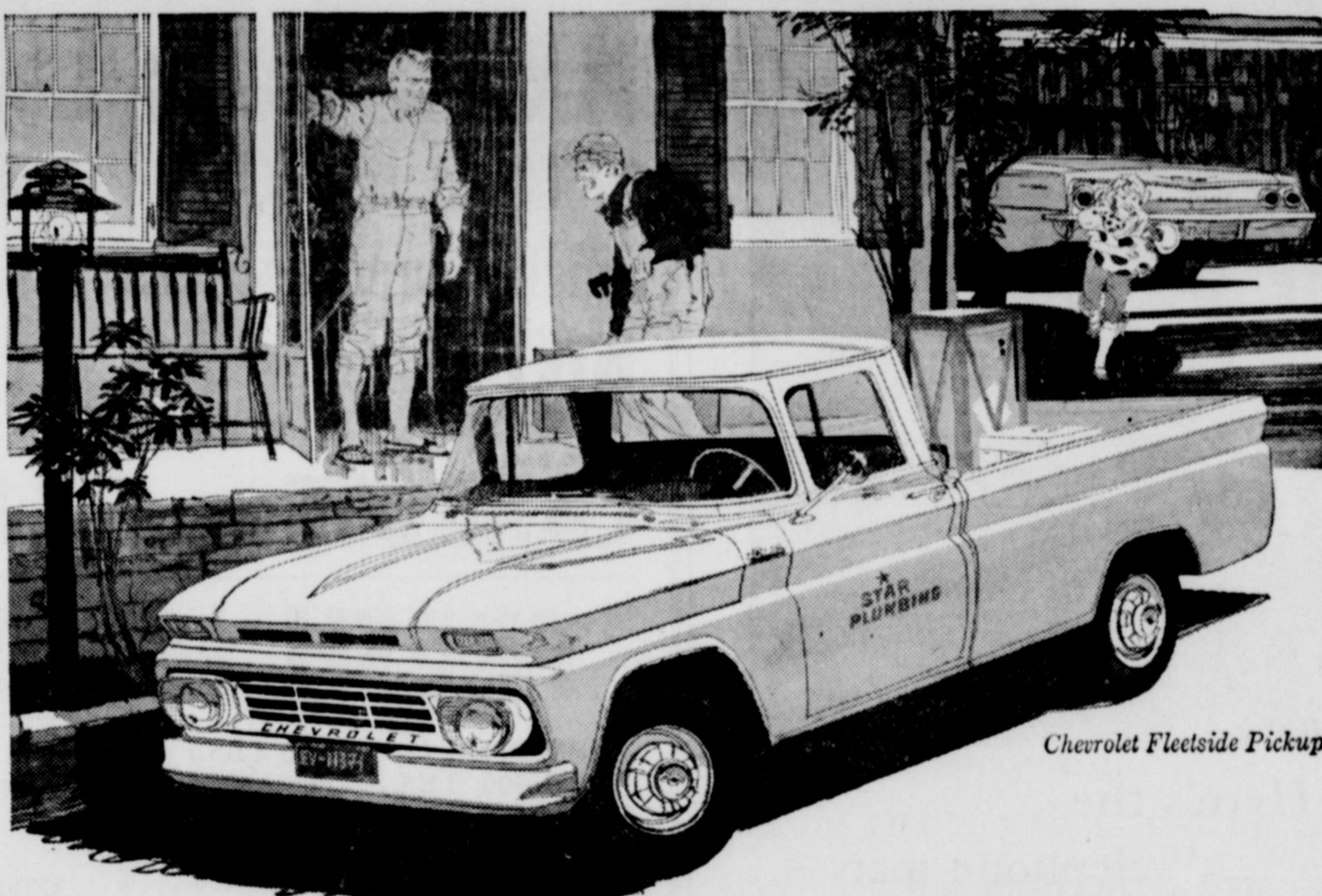
Chevrolet Fleetside Pickup

FREE Write for literature, information and free Congress Travel Guide listing fine motor hotels from Canada to Mexico to EL PASO AUTEL. 8170 BEVERLY BLVD., LOS ANGELES 48, CALIFORNIA