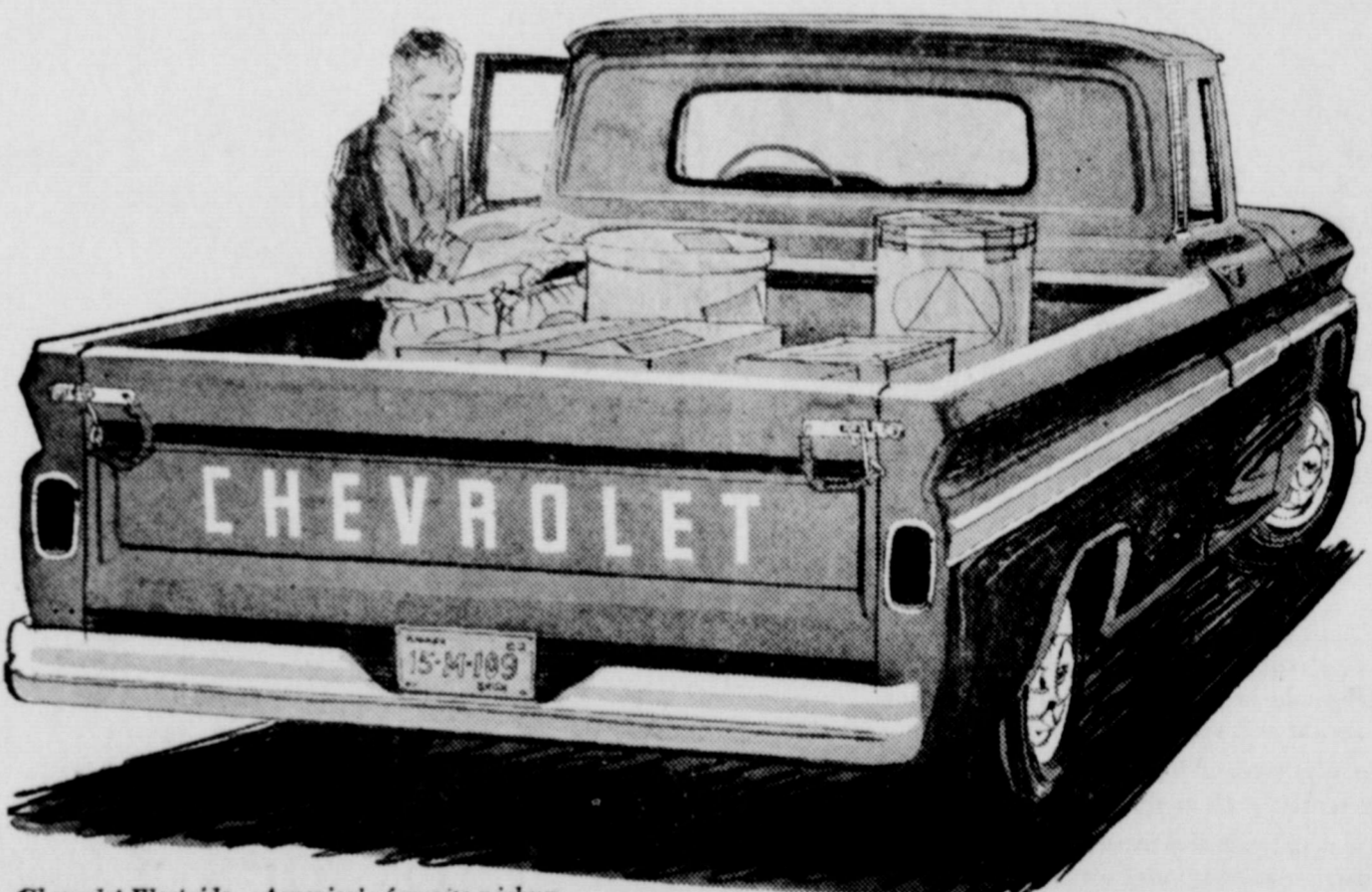
Chevrolet Fleetside—America's favorite pickup

...it's a good one! A truck that doesn't call for a lot of attention, that just does its job every day, is a great asset. This is the thing most users tell us they like about Chevrolet trucks—their reliability. And this, of course, comes from quality. Sound engines, strong frames, double-wall construction, insulated cabs, separated bodies and cabs, tight tailgates . . . are some of the features that help Chevrolet trucks work longer and bring back more of your investment at trade-in. If you wish you had a truck that cost you less thought and attention, put your money on quality. Make your next buy a dependable Chevrolet truck.