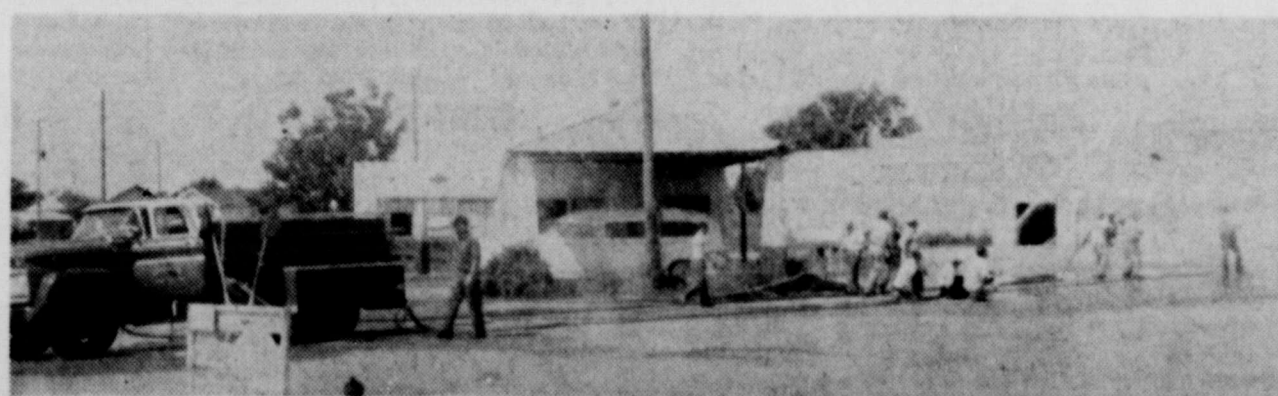
Firemen Have a Field Day with New Truck

Firemen say they still need lots of contributions to pay for the new truck. The city had to borrow some $3,700 to pay off the difference between the truck cost and the amount on hand.