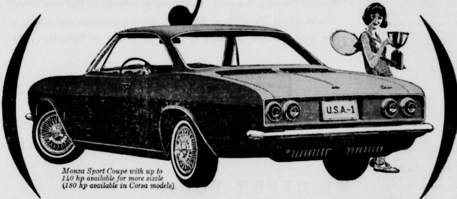
Monza Sport Coupe with up to 140 hp available for more sizzle (180 hp available in Corsa models)