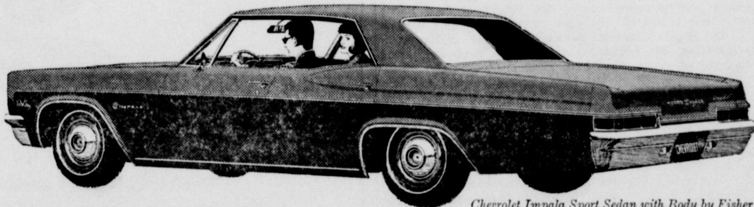
Chevrolet Impala Sport Sedan with Body by Fisher