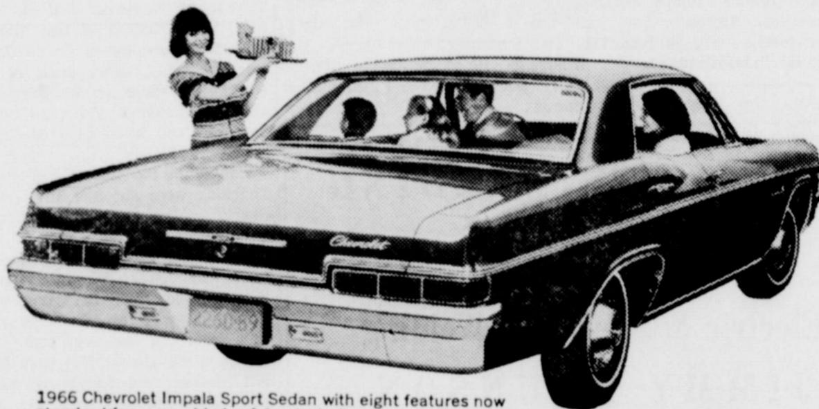
1966 Chevrolet Impala Sport Sedan with eight features now standard for your added safety—including back-up lights and seat belts front and rear (always buckle up!).

What you get is • The meticulous coachwork of Body by Fisher that surrounds you with rich appointments, deep-twist carpeting • Full Coil suspension that uncrinkles roads • Magic-Mirror finish • Gobs of room for hips, legs and feet.